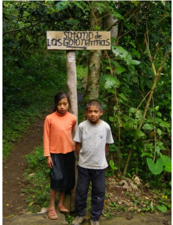
My guides to the "Cave of the Swallows"

On the return, to beat the ice storm, I rode from Houston to home, 1140 miles in 20 ½ hours stopping only for fuel.... (I-10, 12, 59, 65, 71, home) 20's from Mammoth Cave to Louisville, teens from Louisville to home.... Arrived home 5:30 am January 20 th , 16 degrees. Burrrrr.