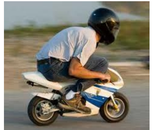
Did a mini bike get you into riding?.