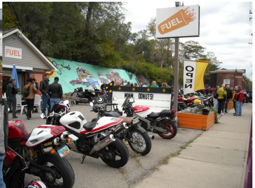
Fuel Coffee Gathering 10/16/2011